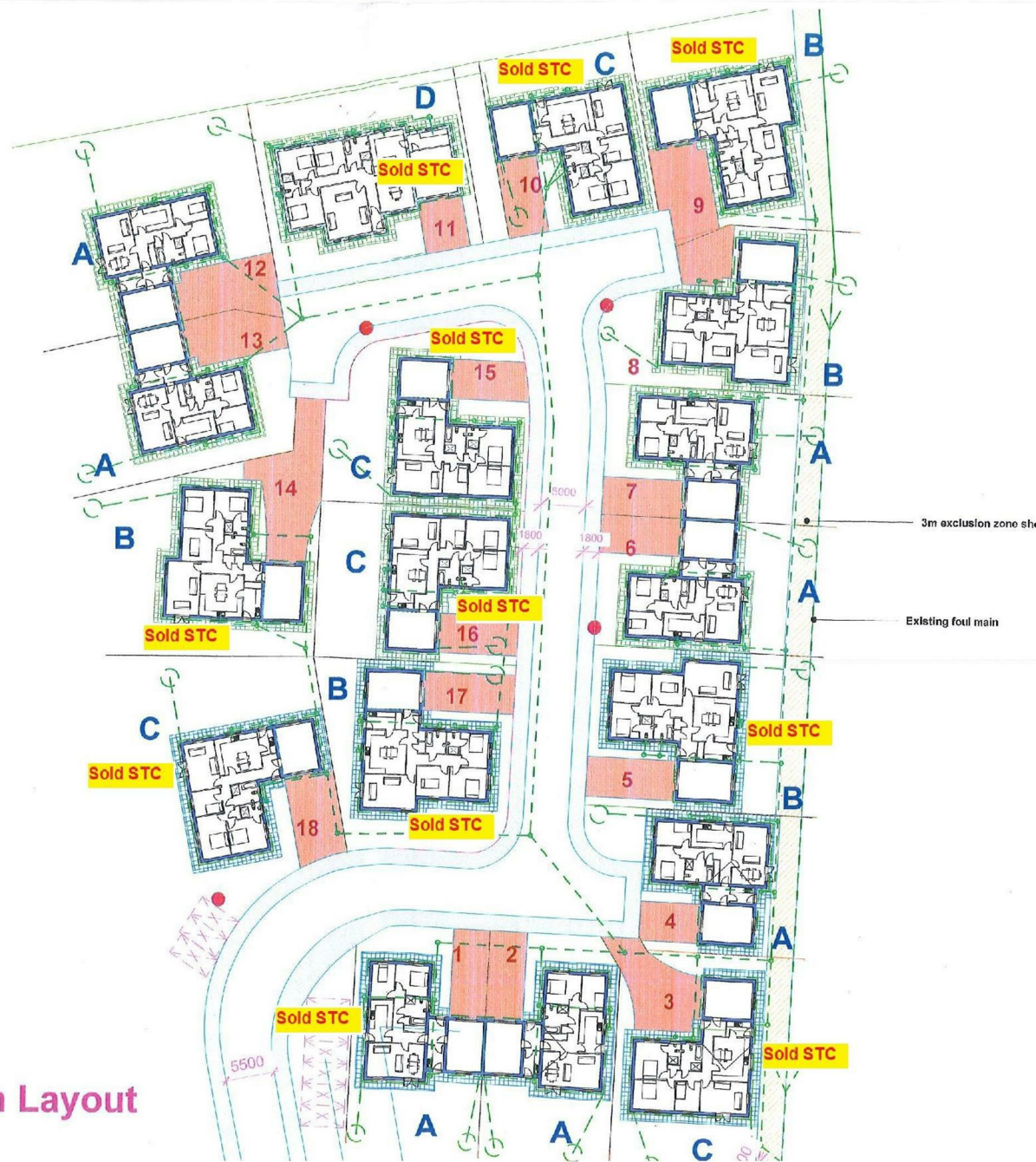
Site Floor Plan Layout 1 : 500